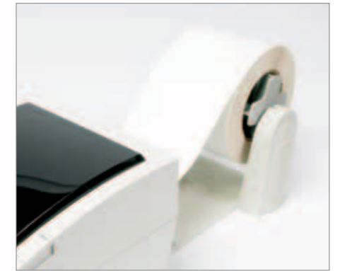
A wide range of options, including an external media stand