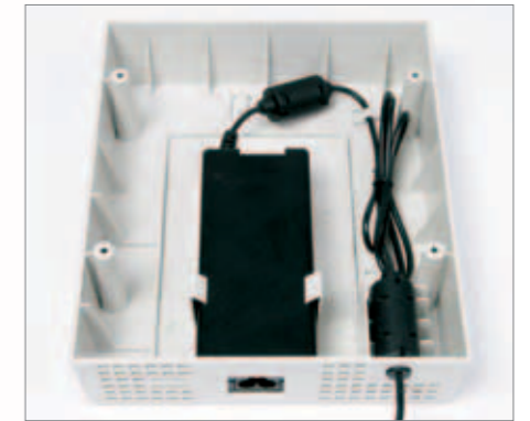
An optional power supply tray for retail installations