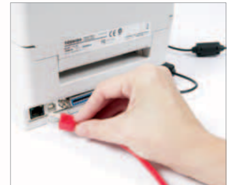
Built-in networking as standard with a 10/100Mbps LAN interface